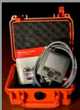
Case not included

Keeping trucks in service is our number one goal, that is why we do our best to use products that are available on the market and are not proprietary to Rosenbauer. An aerial service tool is also available for quick and easy diagnostics of the CAN-bus system.