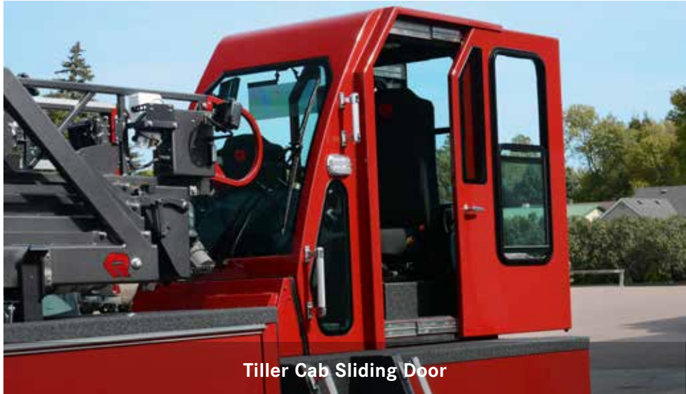
Tiller Cab Sliding Door

Safety is paramount. That's why Rosenbauer offers safety equipment, including a tillerman trainer's seat on every truck, providing extra security during training by allowing an experienced tillerman to sit right next to the trainee.