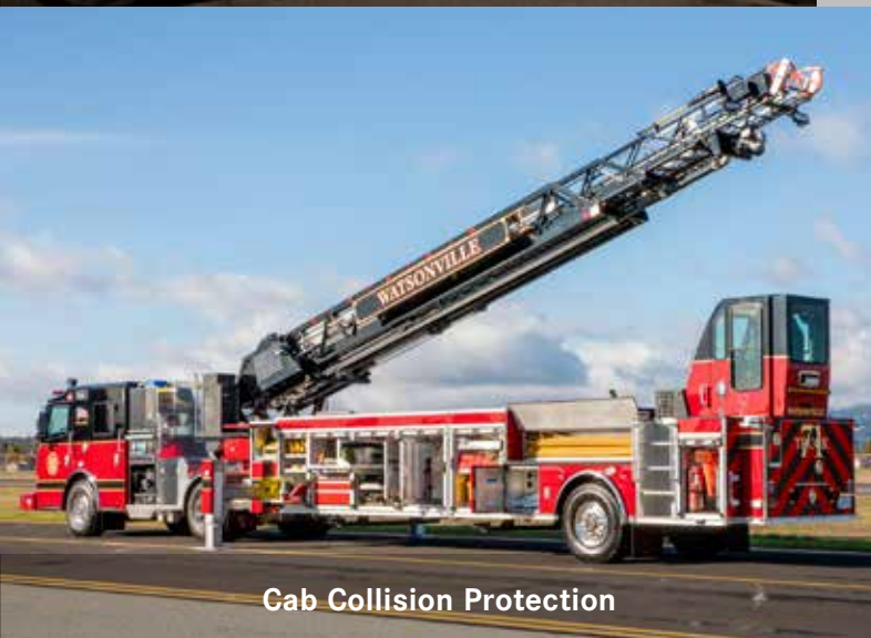
Cab Collision Protection

Whether you prefer a more traditional or contemporary truck, Rosenbauer offers the ability to build your aerial with or without a pre-piped waterway.