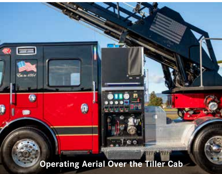
Operating Aerial Over the Tiller Cab