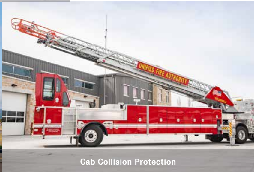
Cab Collision Protection