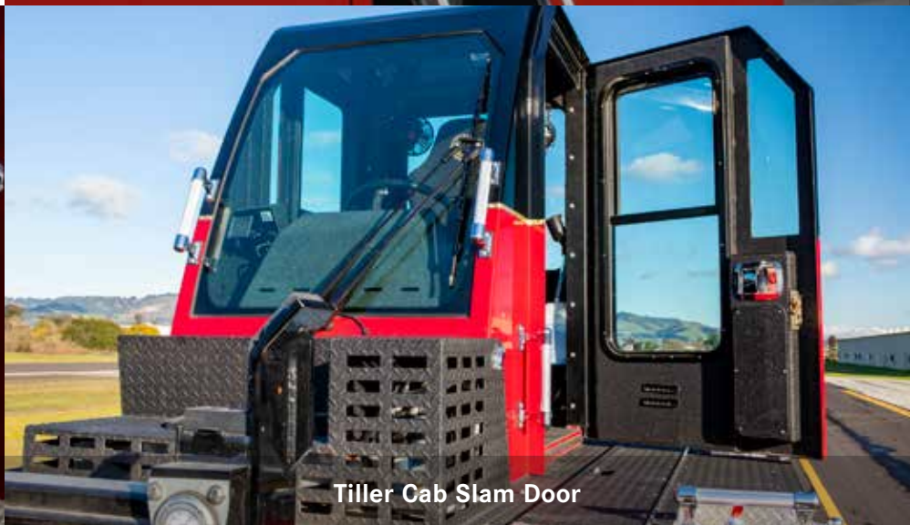
Tiller Cab Slam Door