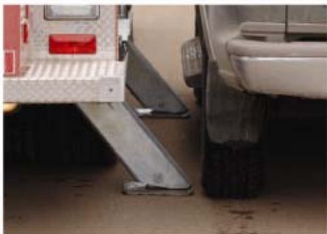
(Left) Outriggers to stabilize the situation.

The Roadrunner uses four angled A-frame outriggers to achieve maximum stability on uneven terrain and allows set-up in close proximity to obstacles. The "jack" legs and aerial torque box are hot-dip galvanized for maximum strength and longevity.