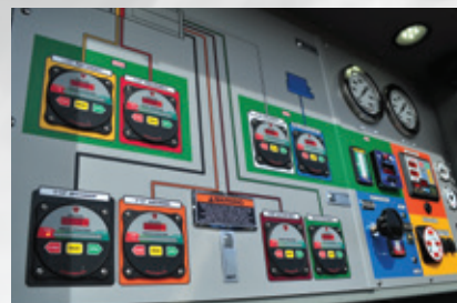
Logi-Color Pump Control Panel