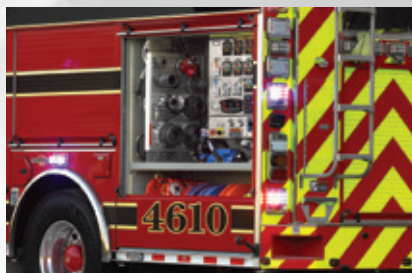
Operator's Side Pump Control Panel