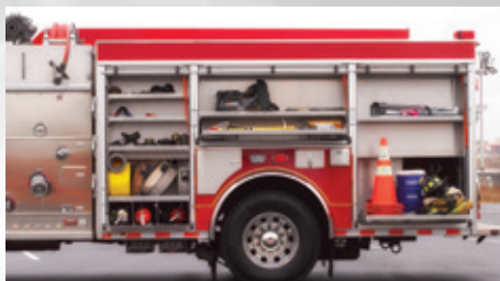
Customized Compartment Storage