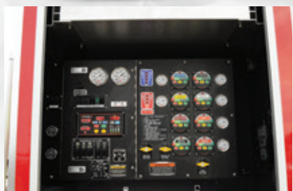
Curb Side Pump Control Panel