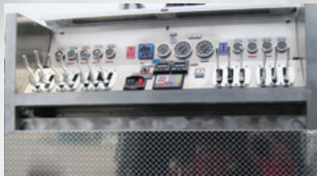
Top Mount Control Panel