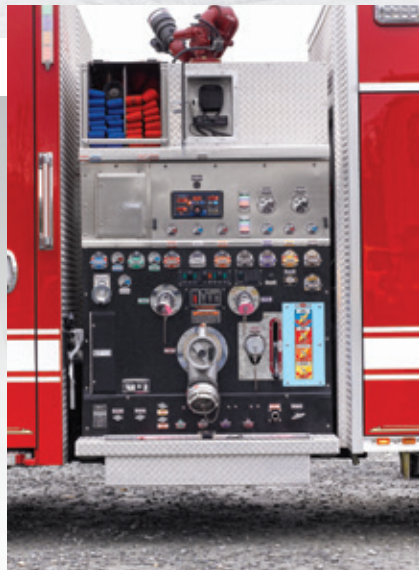
Black Thermal Coated Control Panel