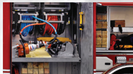
Full-Width Access Compartments