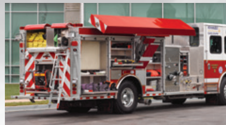
Enclosed Ground Ladder Storage