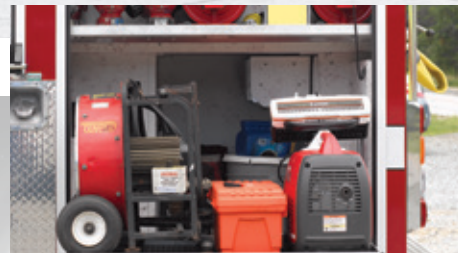
Slide-Out Equipment Trays