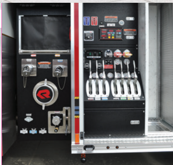
MP3™ Pump Control Panel with Sealed Bank