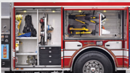
Full-Depth, Full-Height Side Compartment