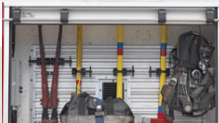
Customizable Tool Storage