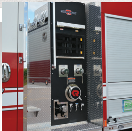
TP3 Pump Control Panel with Sealed Bank