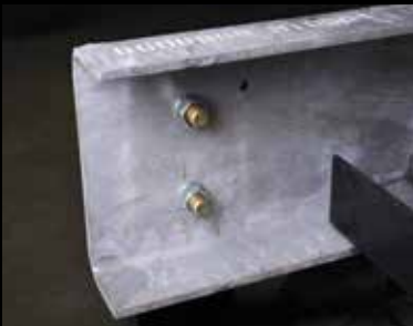
Hot Dip Galvanized Rail and Cross-Members Optional