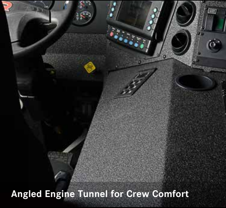
Angled Engine Tunnel for Crew Comfort