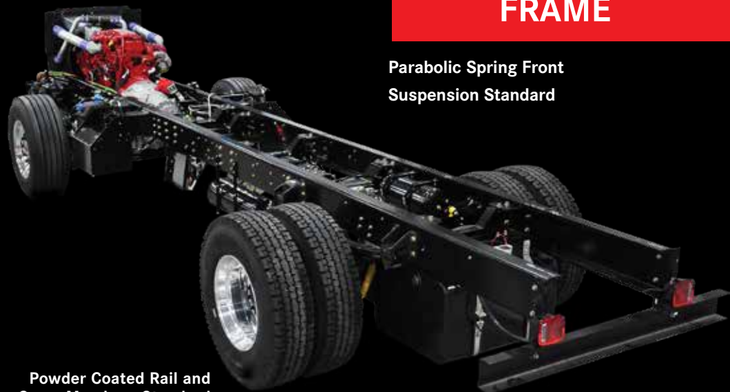
Powder Coated Rail and Cross-Members Standard