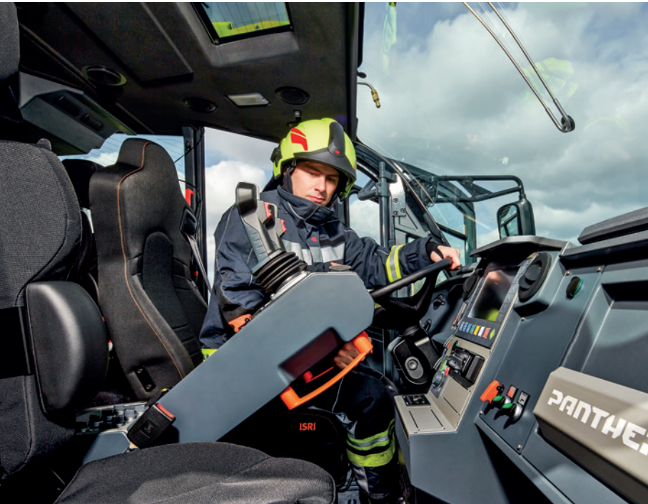
Optional Folding center console

The new, ergonomically-optimized joystick with backlit buttons ensures clear and easy operation of the turret. And with increased visibility overhead without the risk of glare. The folding center console enables a quick change between driver and passenger seat as well as a direct exit on the opposite side. The step compartment allows the loading of the rear compartment up to the lower body edge and quick handling through the new opening design. The full-height compartment on the left side is significantly longer, creating more space for equipment. All important areas such as access, pump compartment, rear compartment, and the full-height compartment is optimally illuminated.