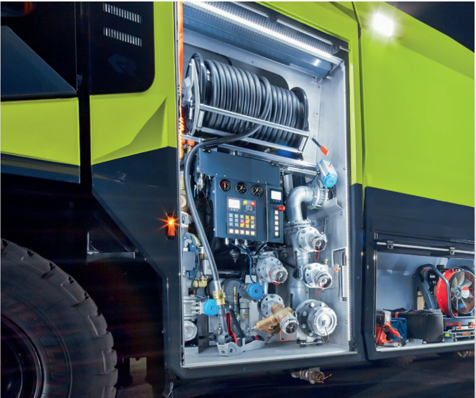
Pump compartment illumination

The improvements and innovative features of the new PANTHER enable a better overhead view in the cab and easier control of the turret. The driver's cab impresses with its space-optimizing design as well with additional storage compartments and stowage options