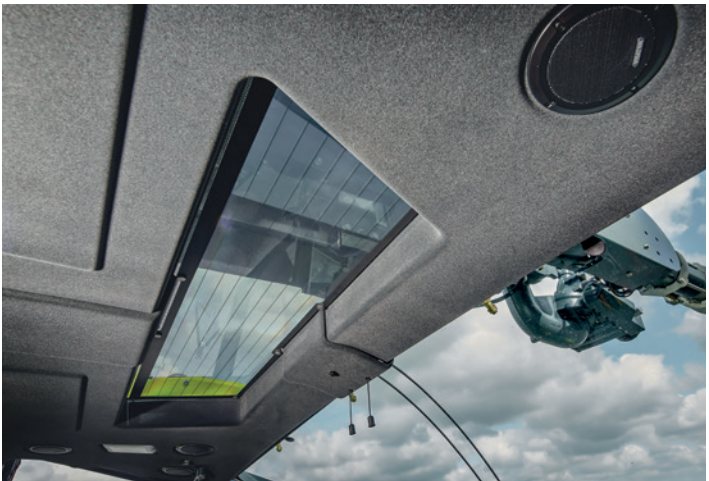
Cab with roof window

All innovations and improvements in the area of usage and operating comfort are aimed at better ergonomics, visibility and freedom of movement for the operation of the new PANTHER.