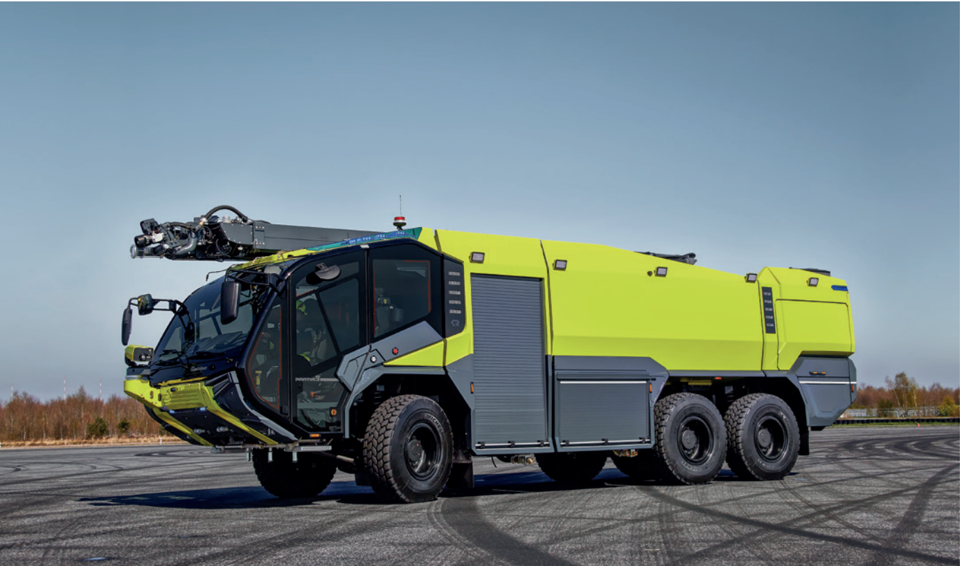
Panther 6x6 w/HRET