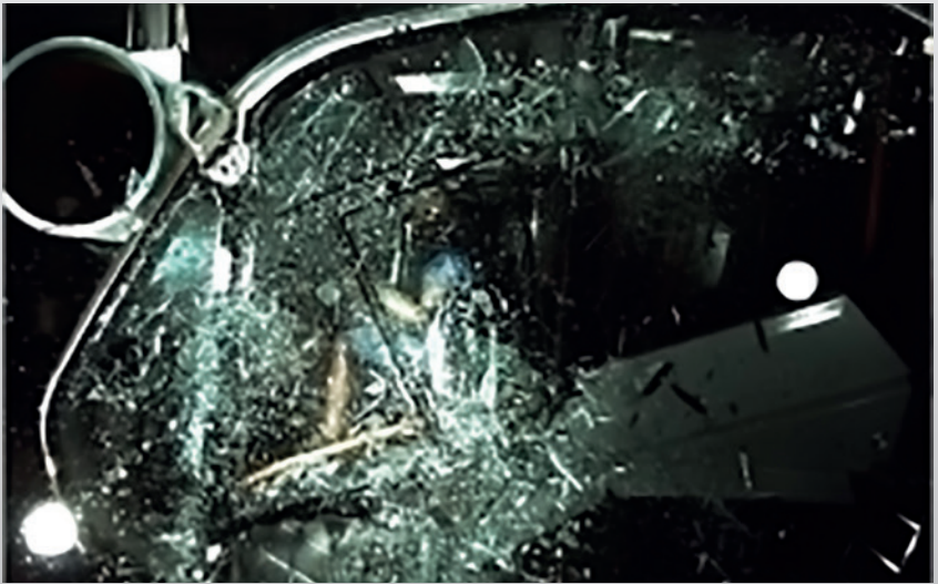
ECE R 29-3 Cab Frontal Impact Test.