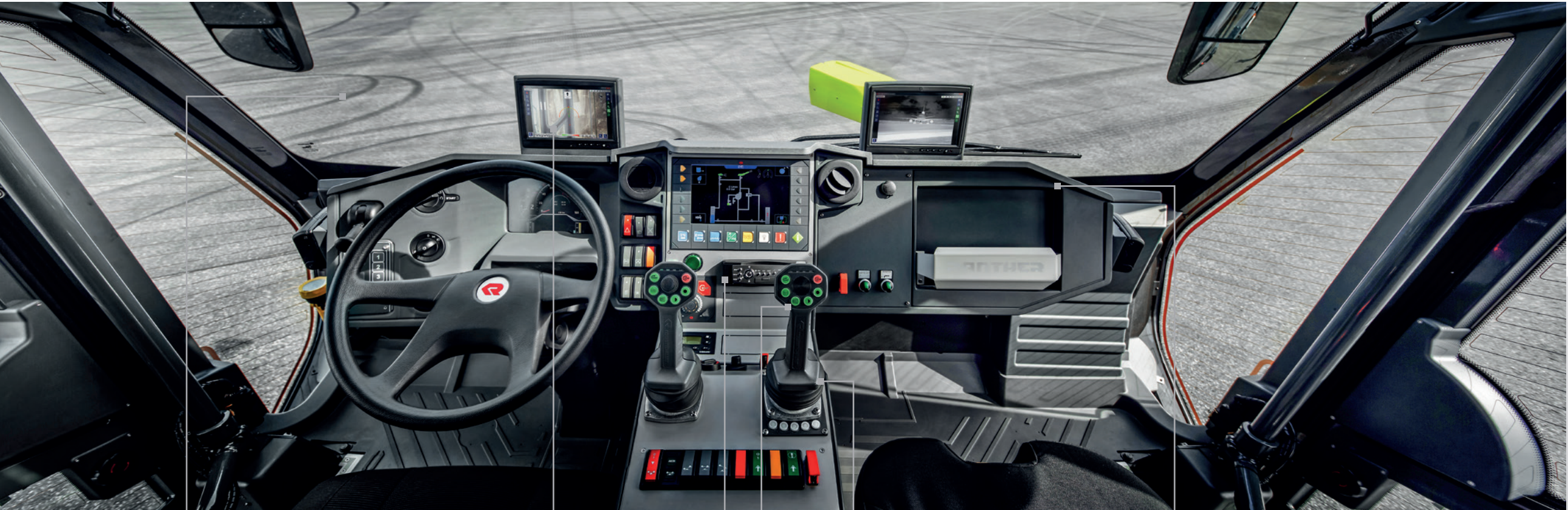
Increased visibility with larger front and side glass

Rosenbauer is the world's largest firefighting equipment supplier, with vehicles, extinguishing technology, equipment, and telematic solutions, as well as being a pioneer in the sector with its innovative strength.