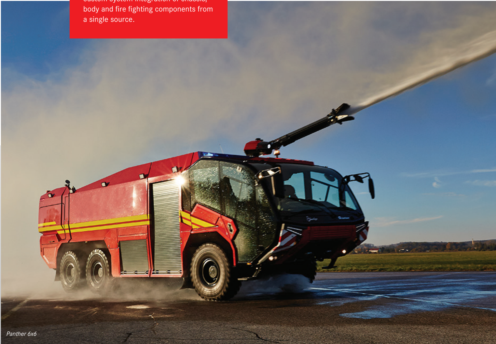
6 Panther 6x6

With the Panther, Rosenbauer offers custom system integration of chassis, body and fire fighting components from a single source.