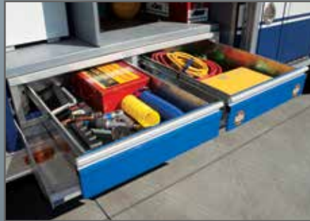
40" deep slide-out drawers in the bottom of the compartments are only available with a drop/pinch frame body or trailer.