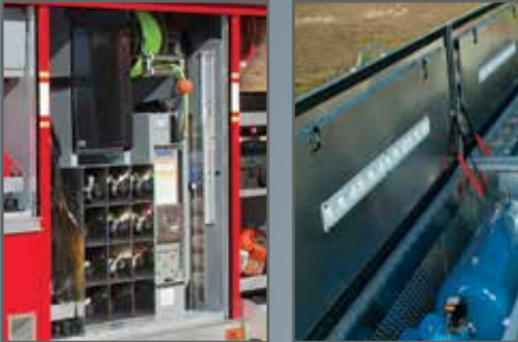
Recessed LED lighting and unistrut shelf track gives maximum compartment width.