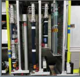
Slide-out toolboards for various rescue strut brands and configurations.