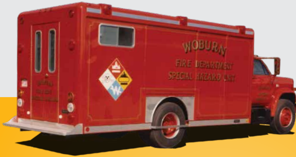
1988 REAR COMMAND UNIT

It has always been about space! That was the case in 1986 when a HazMat captain stopped at a local convenience store for coffee on the way to start his next shift. He found himself standing in front of a Hackney delivery truck with coffee in hand staring into a cavernous compartment. He was amazed at the depth of the compartments and the amount of storage space. It was the solution the department had been looking for to transport the vast amount of equipment associated with hazardous materials response. A call was placed. A HazMat truck was built and delivered. And the rest is literally history.