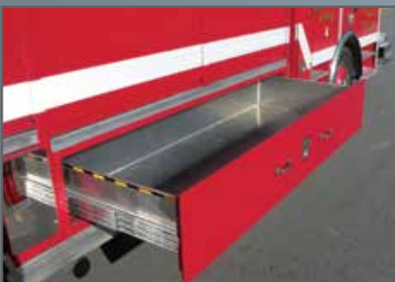
40" deep slide-out drawer is available as an integral part of the body.