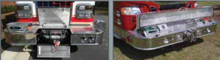
Custom front bumper configurations include combinations of electric cord, air, and hydraulic reels along with mounting for extrication tools and permanent mounted or removable winches.