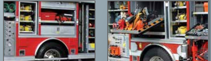
Hackney offers the largest wheelhousing compartments in the market which allow for various custom configurations of equipment storage.