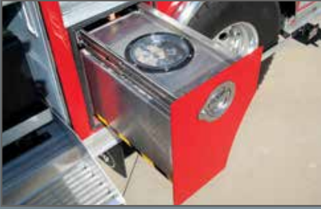
Granular absorbent dispenser with 80 lb. capacity in the wheelwell skirt.