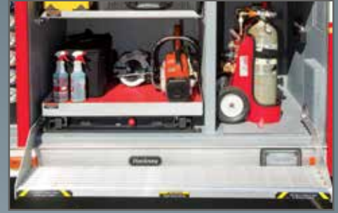
Fold-down compartment steps rated at 600# and stowed inside of the compartment.