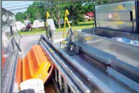
Roof compartments configured for mission specific equipment and equipped with recessed LED light and hold-open pneumatic spring on the lids.