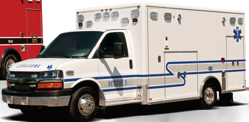
GMC / CHEVY

Horton Type III ambulances come standard with all of the features you know and trust to be part of the safest and highest-quality ambulance on the market: